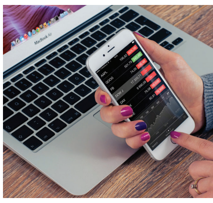
VI markets offer a wide range of instruments on both Forex and CFDs